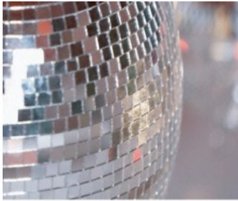
FOOTSTEPS IN THE DARK GEORGE LIPSITZ The Hidden Histories of Popular Music